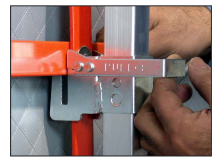
STF18-RUB Roll-up sign bracket