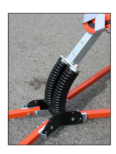
STF18 Dual heavy duty springs for wind relief