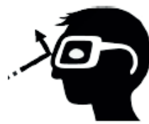
Safety Goggles Required