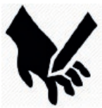
Pinch Point Warning