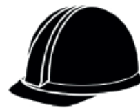
Hard Hat Required