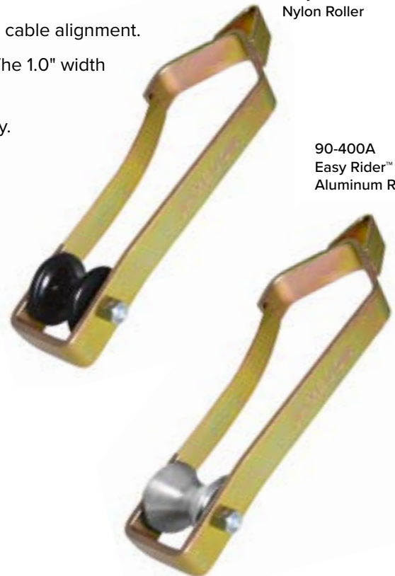
90-400 Easy Rider® with Nylon Roller